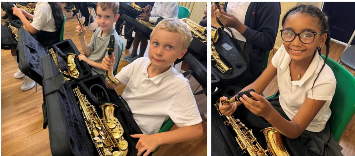
5BH are over the moon to be learning the saxophone this half-term!