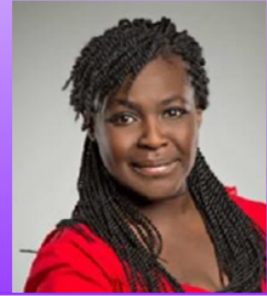
Dr. Maggie Aderin-Pocock

I am the scientist in charge of the United Arab Emirate's missions which is sending space probe, Hope, to Mars.