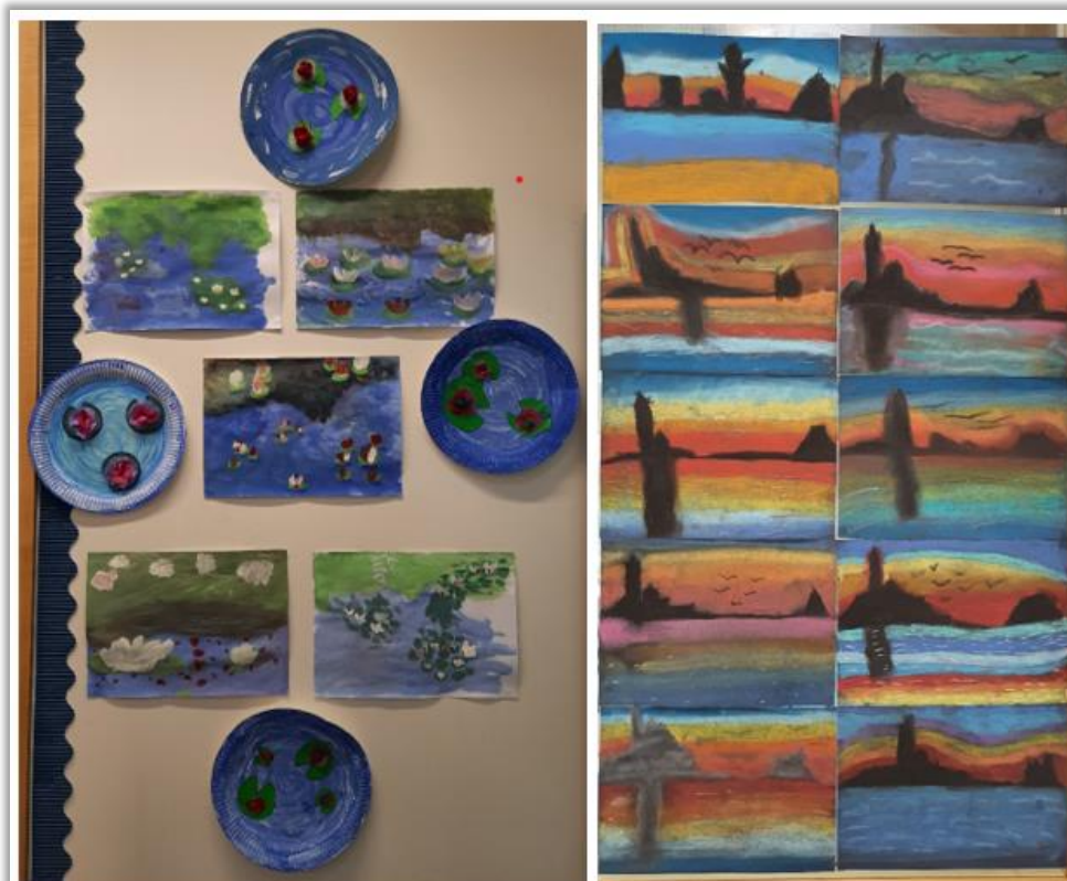
Year 6 'Water lilies' and 'San Giorgio Maggiore at Dusk' - Claude Monet.

At the start of the academic year, we support the transition of the children into their new classes through an art project with this year's theme being 'flowers'. During this project, the children learn about different art techniques and artists, before producing their own art inspired by the artist/s. Below is an example of some work that was produced by children in year 6: