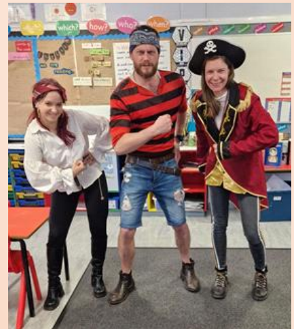
Children (and teachers!) in Year 2 getting started on their Pirates topic.