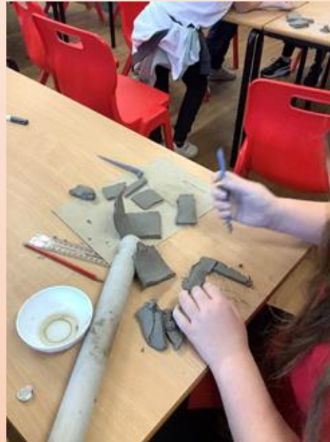
Children in Year 6 using clay to make their own pots while learning about Ancient Greek pottery.