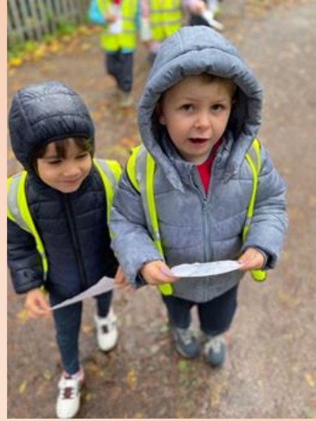
Year 1 children using maps to find their way to the library as part of their Explorers topic...