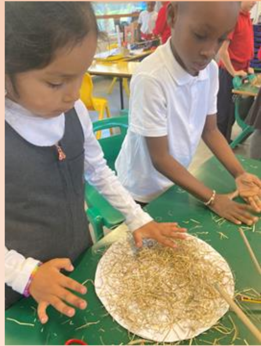
Year 3 children making stone age houses for their Stone Age to Iron Age topic.