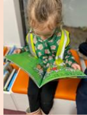
...then enjoying their session at the library.