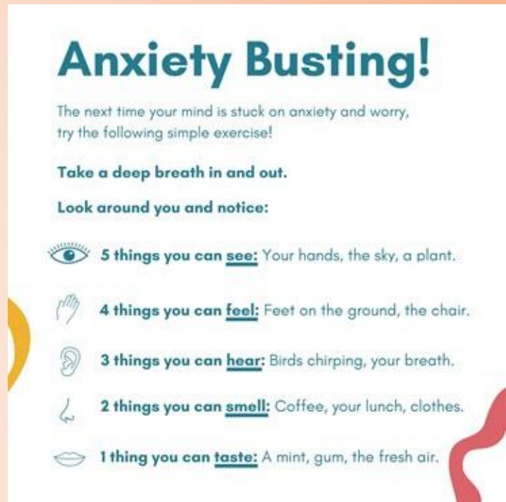
One of our wellbeing exercises