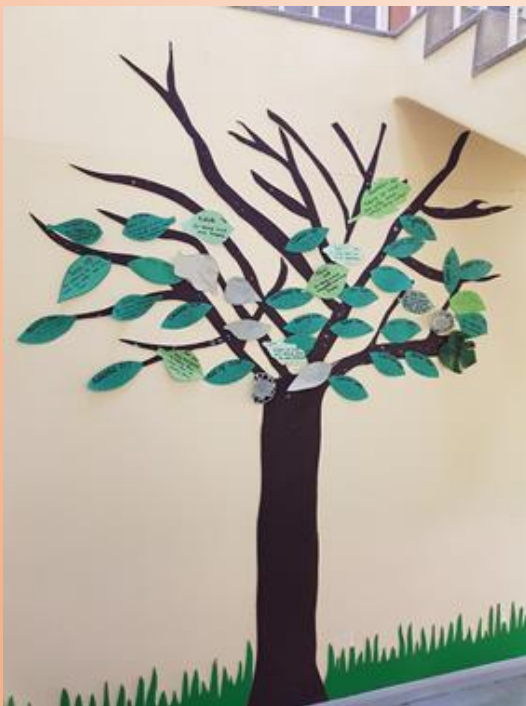
Our Kindness Tree