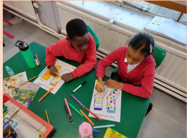
Odd socks for anti bullying week

Today we dressed up in spots and stripes and collected money for Children in Need which we also linked to our value of Self Aware and Supportive.