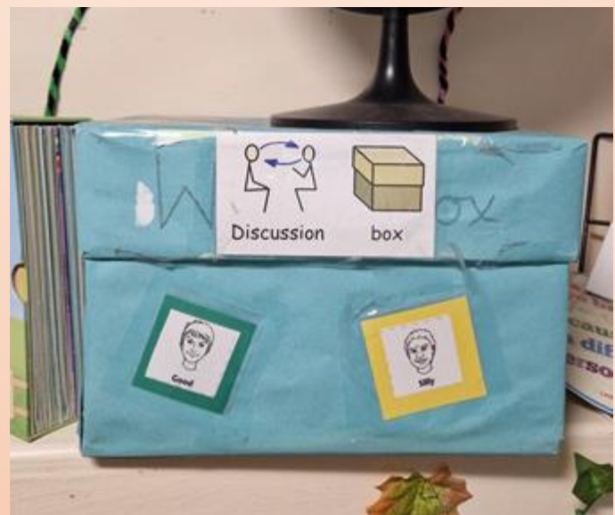
Class discussion boxes for sharing feelings