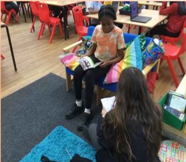
Students from local secondary schools, JAGS, Alley'n's and Dulwich College volunteer to support our reading and help at after school clubs.