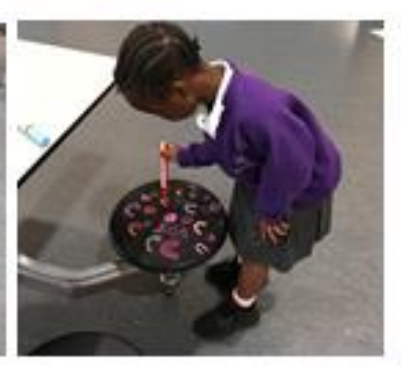
Nursery bug hunting and making