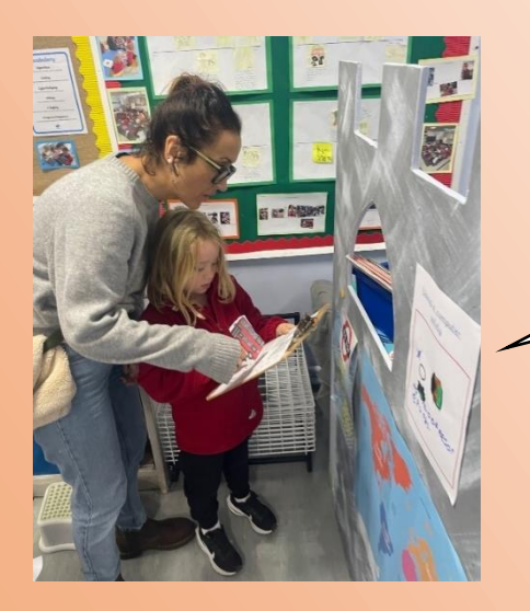
Good to see the different types of activities the children get up to on a daily basis.

Great to see the kids interacting together.